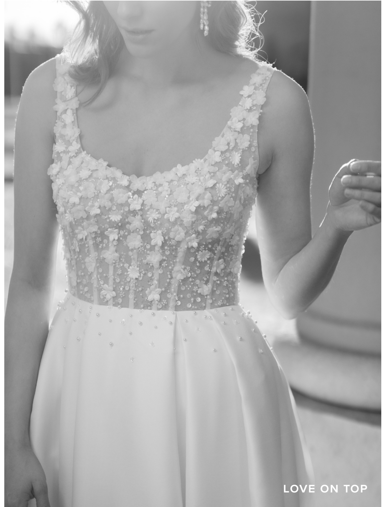
LOVE ON TOP