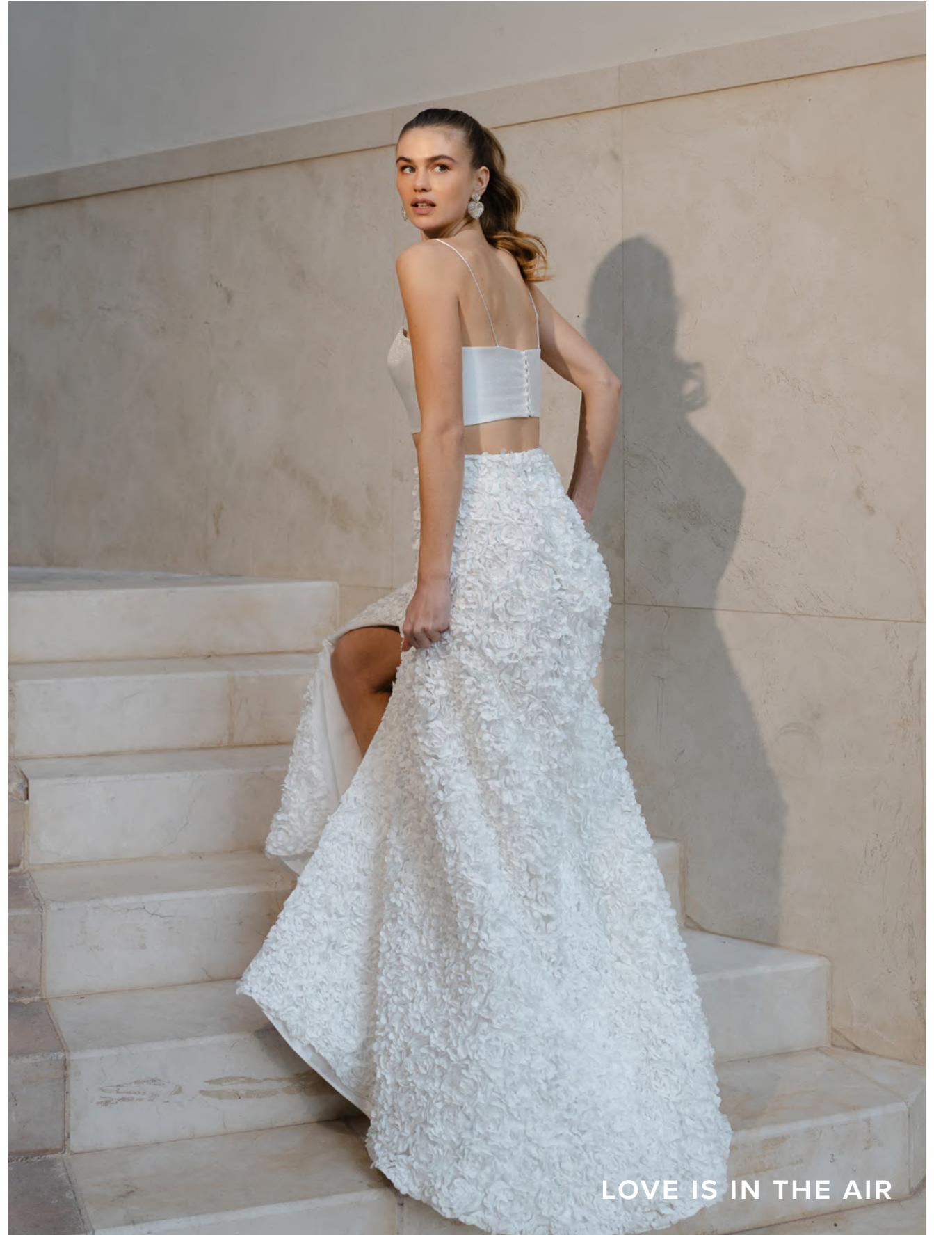
LOVE IS IN THE AIR