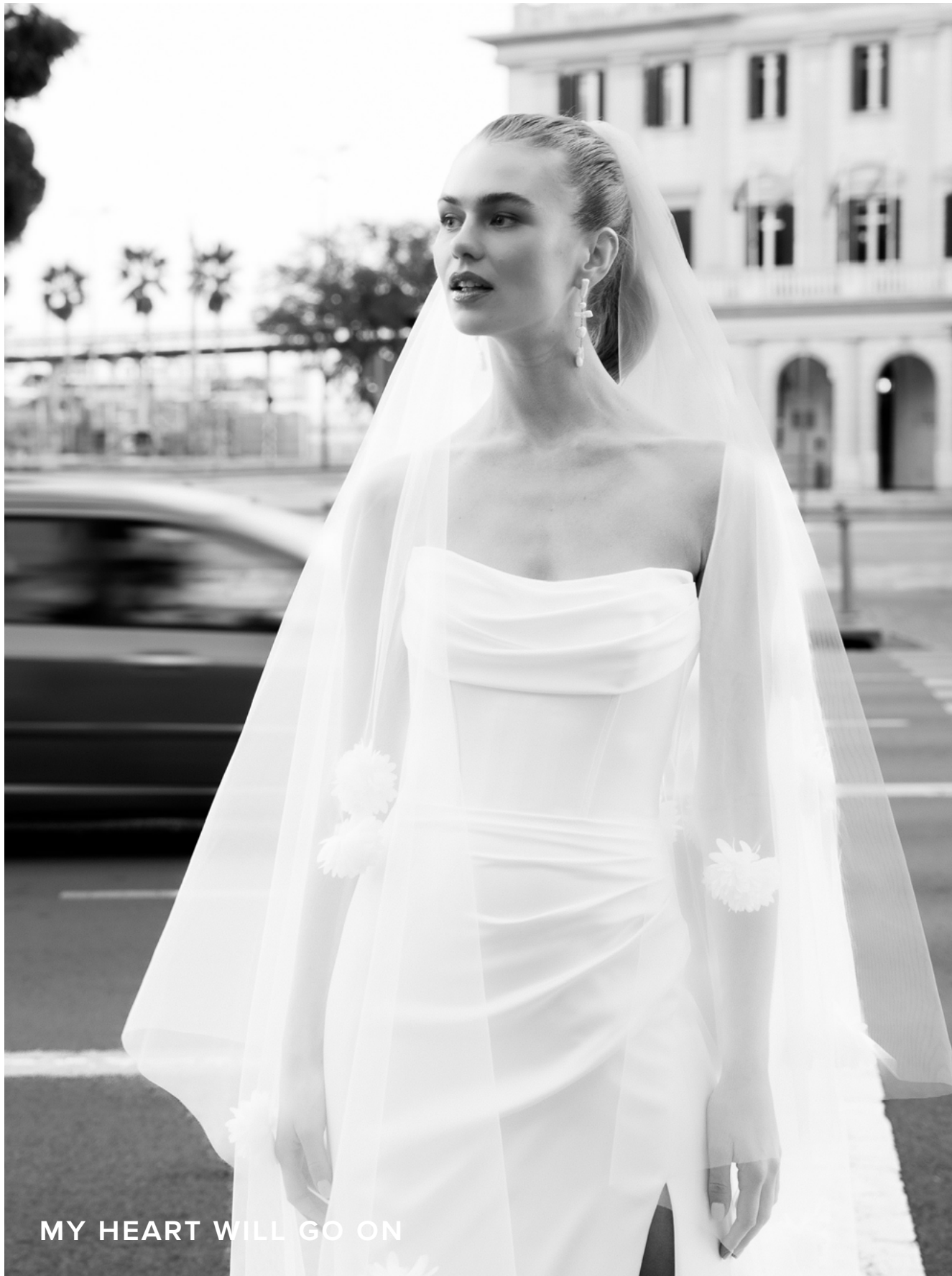
MY HEART WILL GO ON