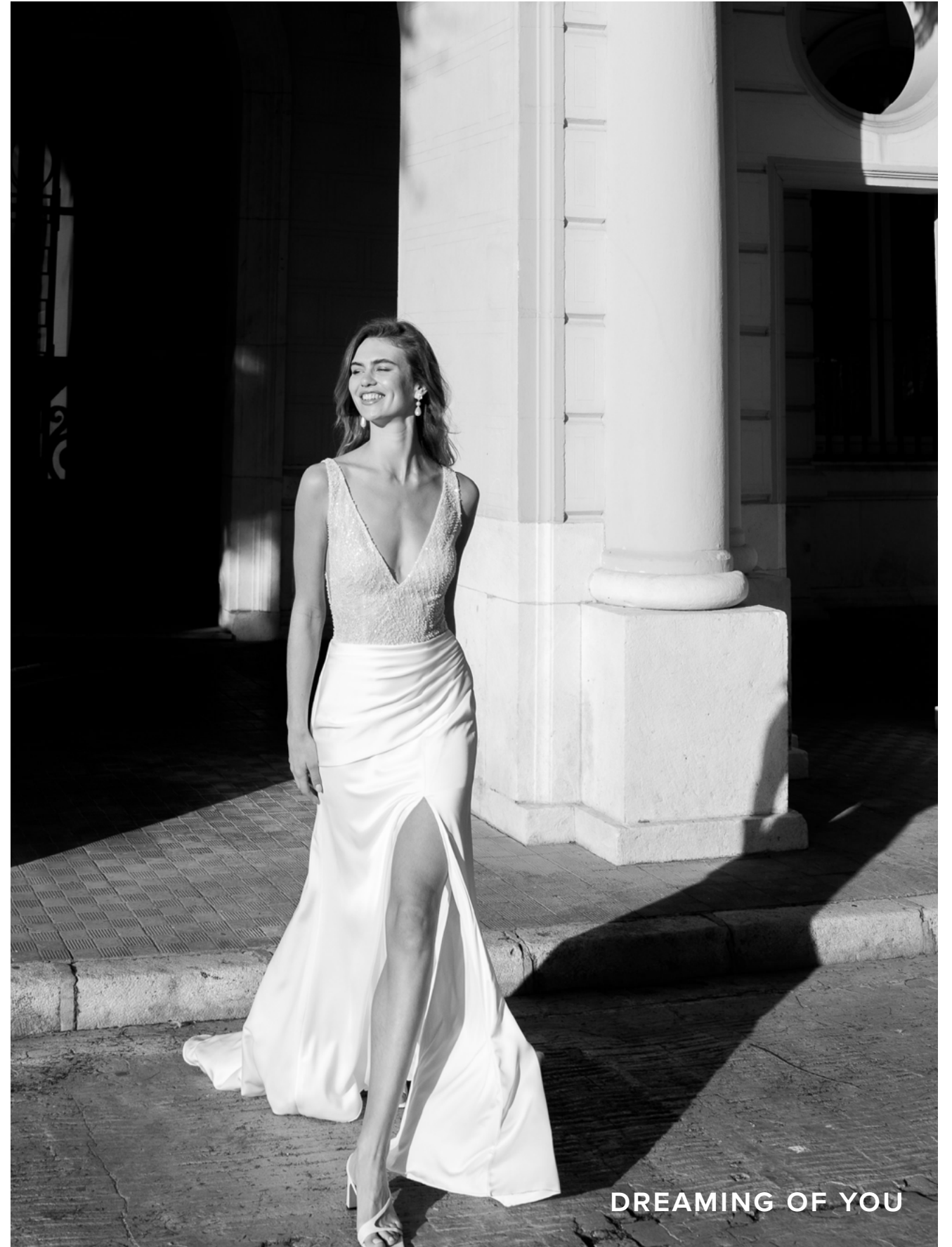
DREAMING OF YOU