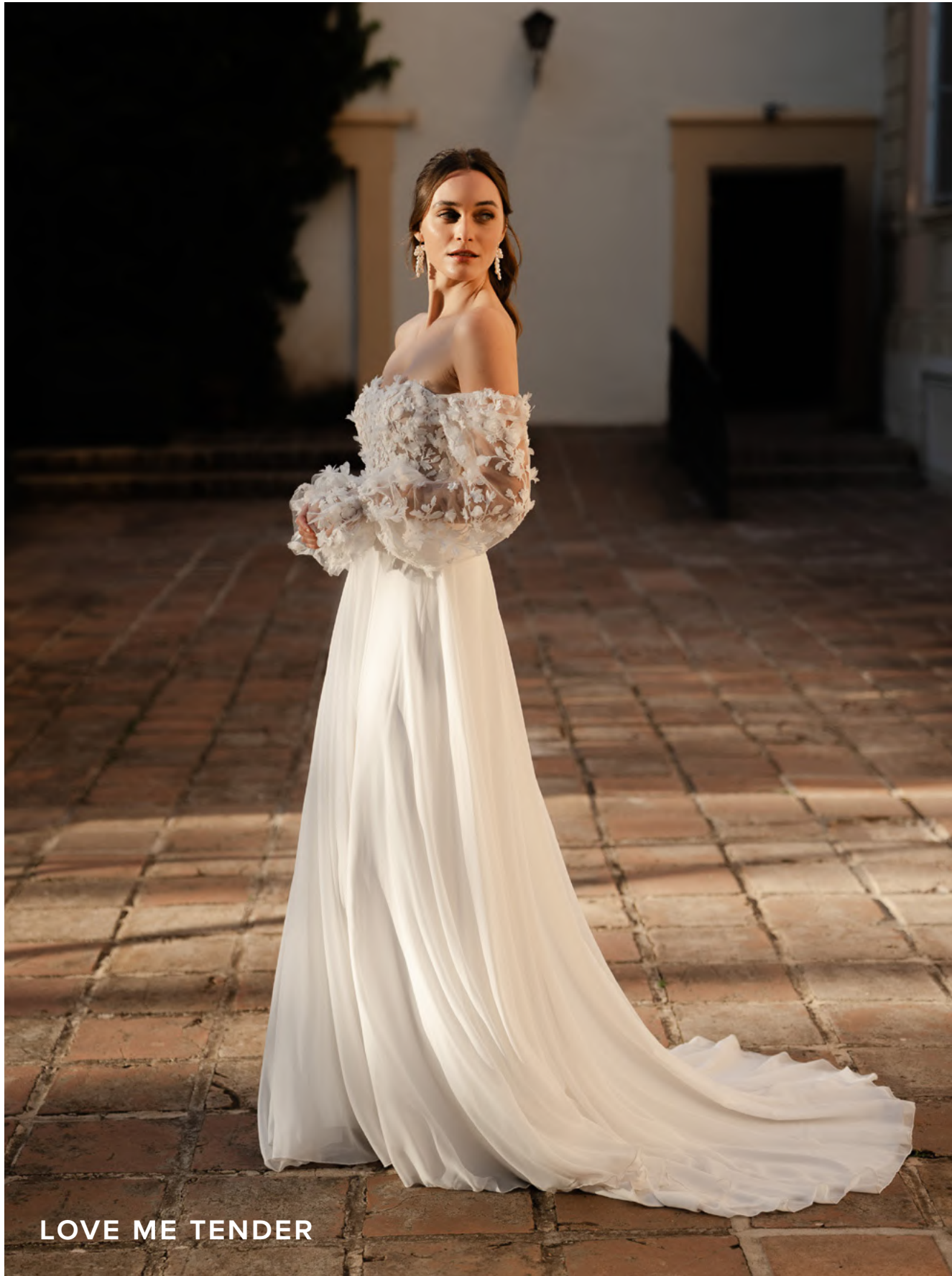
LOVE ME TENDER