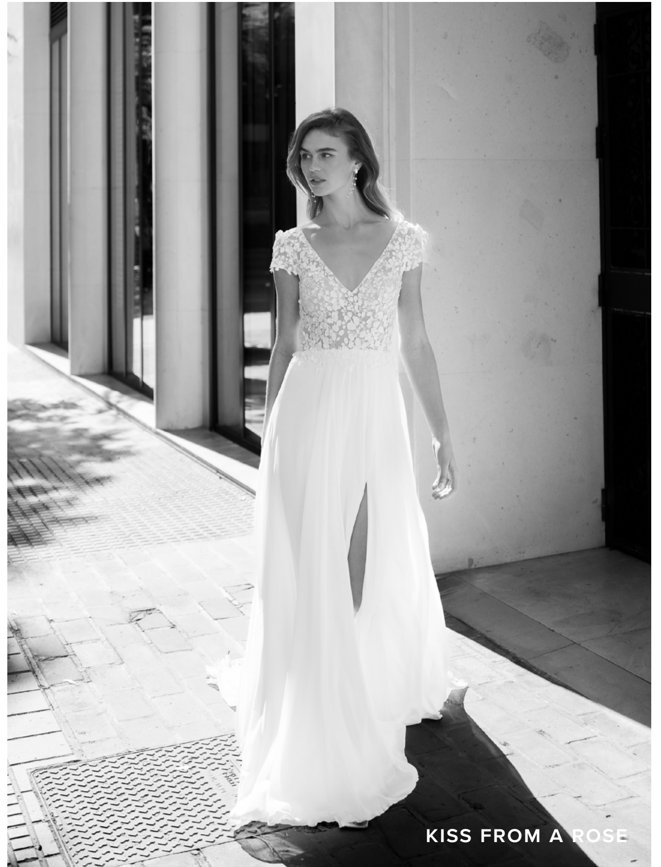
KISS FROM A ROSE