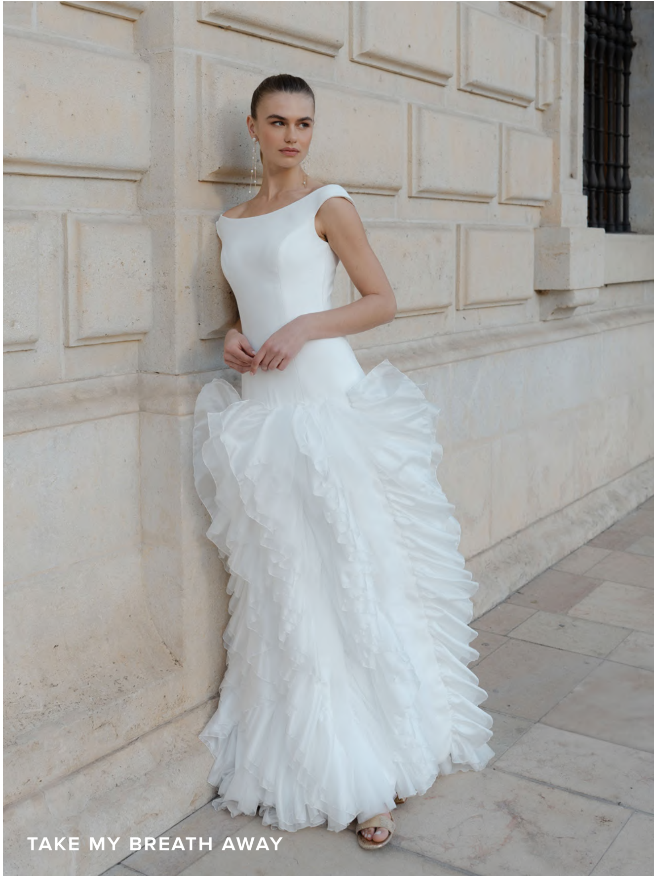
TAKE MY BREATH AWAY