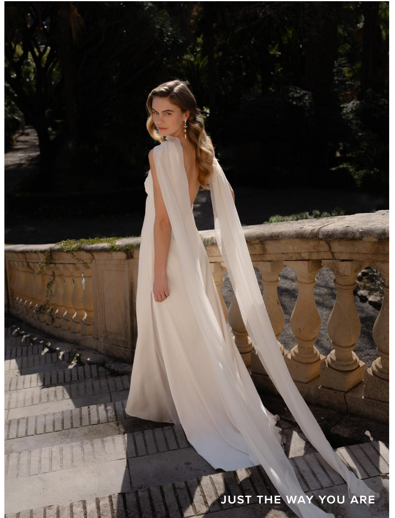
JUST THE WAY YOU ARE