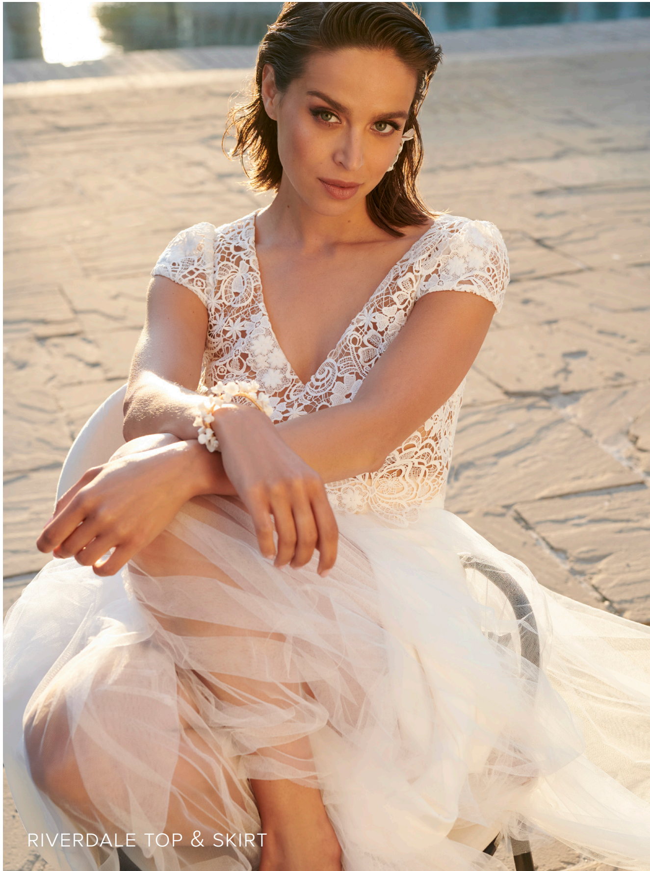
RIVERDALE TOP & SKIRT